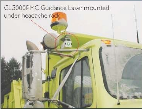
GL3000PMC Guidance Laser mounted under headache rack