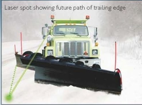
Laser spot showing future path of trailing edge